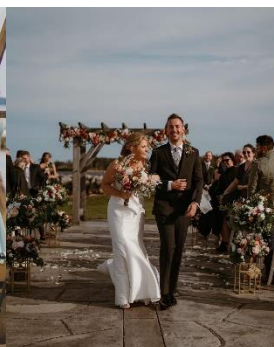
Jessie Snair Photography