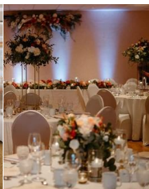
Jessie Snair Photography